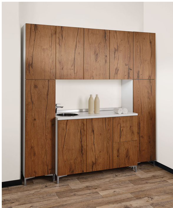
IN PHOTO MATERIAL: VINTAGE 01

Le immagini sono fornite al solo scopo illustrativo e non costituiscono elemento contrattuale