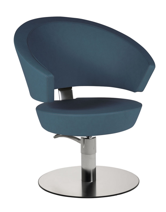
IN PHOTO COLOUR: PEACOCK BLUE N3 Le immagini sono fornite al solo scopo illustrativo e non costituiscono elemento contrattuale