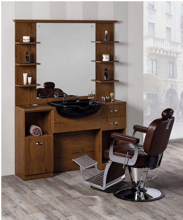
IN PHOTO MATERIAL: VINTAGE 01

Le immagini sono fornite al solo scopo illustrativo e non costituiscono elemento contrattuale