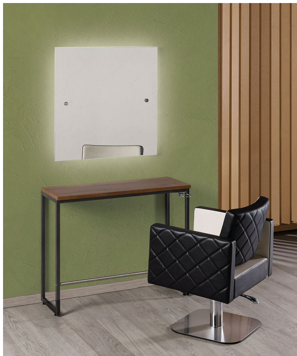
OBERFLÄCHEN IM FOTO: VINTAGE 01

Le immagini sono fornite al solo scopo illustrativo e non costituiscono elemento contrattuale