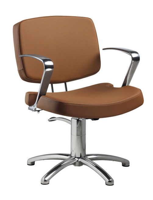
IN PHOTO COLOUR: COGNAC N5 Le immagini sono fornite al solo scopo illustrativo e non costituiscono elemento contrattuale