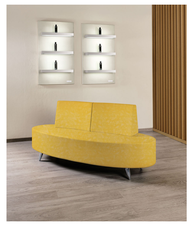
IN PHOTO COLOUR: YELLOW PEARL P7 Le immagini sono fornite al solo scopo illustrativo e non costituiscono elemento contrattuale