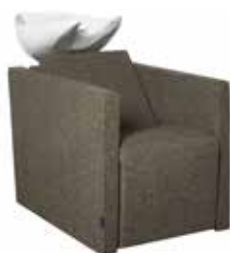
WU/770 - WU/771